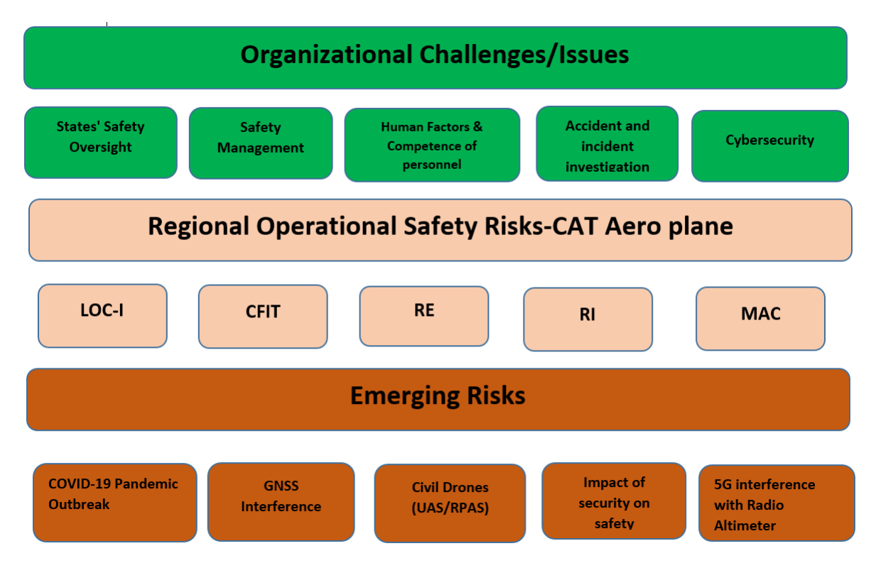
Graph 2: Safety Priorities

Therefore, the MID-RASP adopts three focus areas approach: